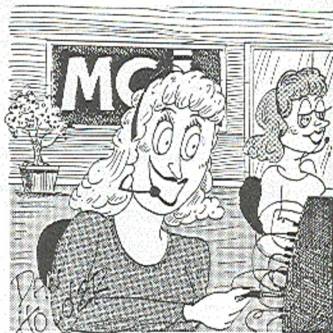
"You're very welcome, sir. And thanks for abusing AT&T!"